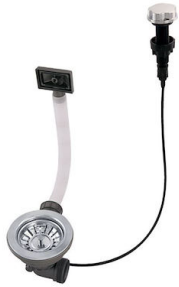
Automatic waste fitting 8407 100