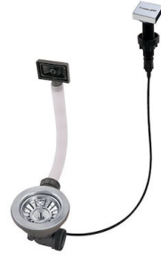
LIRA automatic waste fitting 8407 102