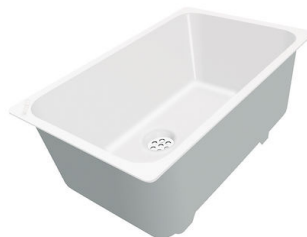
White bowl 8153 100

* only in combination with the accessory 8644 101